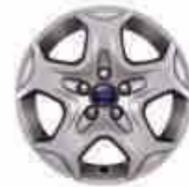
16" 5-spoke 'Design' wheel (Accessory)