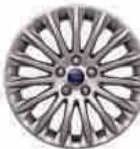
17" 15-spoke alloy wheel (Part of optional Focus Titanium Pack and accessory)