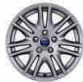
16" 7x2-spoke alloy wheel (Accessory)