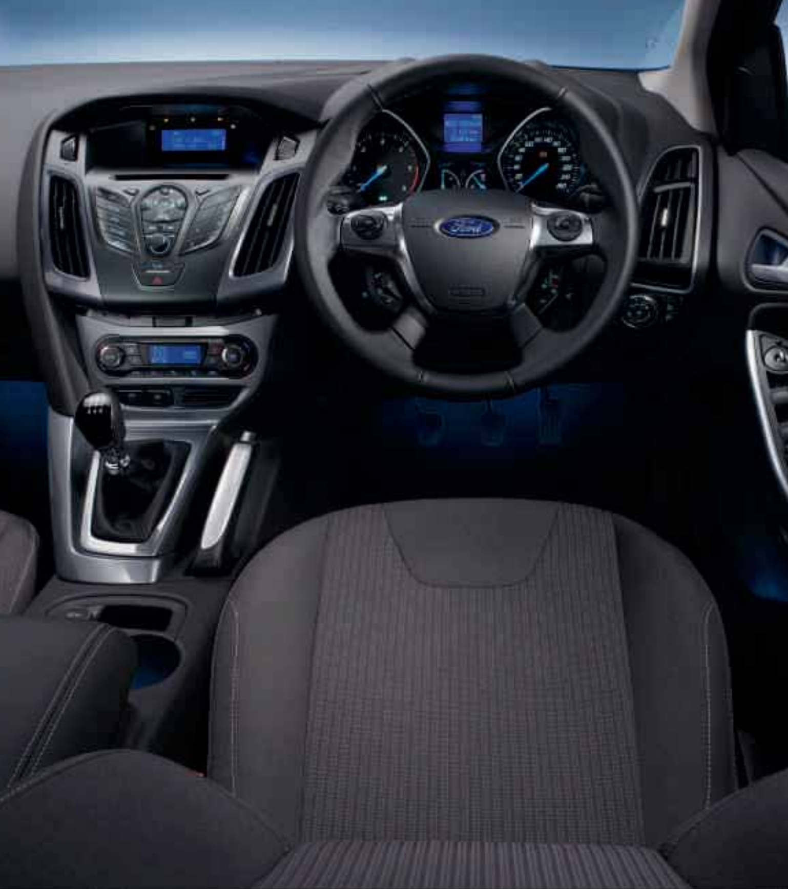
Image on left depicts Focus 'Titanium' interior with optional Bluetooth® Pack. Image below depicts Focus 'Titanium' 5-door in Moondust Silver metallic paint (option).

The very latest innovative technology and contemporary luxury make Titanium the ultimate new Ford Focus.