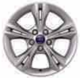
16" 5x2-spoke alloy wheel (Standard on Focus Zetec and accessory)