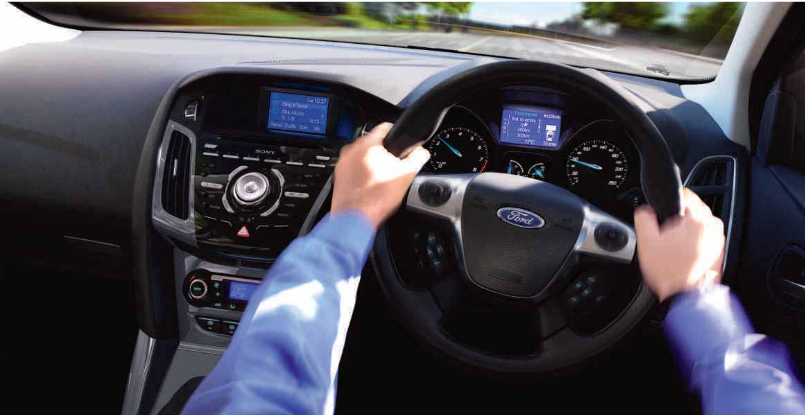
Model shown is a Ford Focus Titanium with SONY Pack (option) and Touring Pack (option).

The dynamic personality of the new Ford Focus continues inside. The driver-oriented cockpit wraps around you, so you'll feel completely at one with the car, with the latest technology and features at your fingertips.