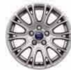
16" 10x2-spoke alloy wheel (Standard on Focus Titanium and accessory)