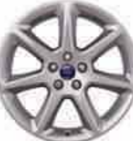
18" 7-spoke alloy wheel (Accessory)

Image opposite shows Ford Focus in Candy Red metallic paint (option) with 18" 5-spoke alloy wheel (option and accessory).