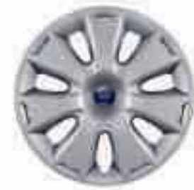
16" 7x2-spoke wheel cover (Standard on on Focus 'Edge')