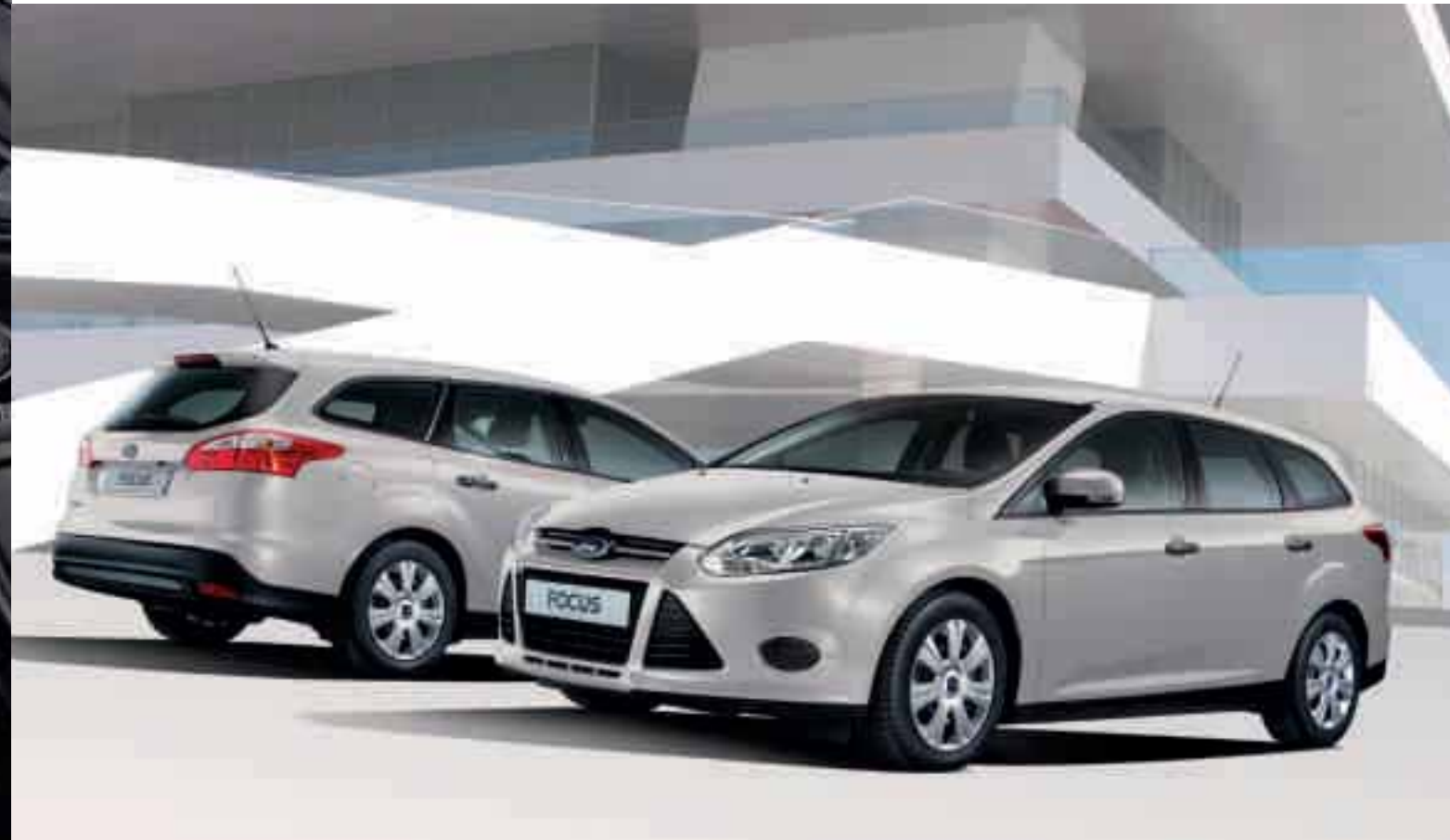
Image on left depicts steering wheel with toggle controls, this is an option as part of the optional Bluetooth® Pack. Images below depict Focus Estate in Moondust Silver metallic paint (option).

The new 'Focus' is the stylish introduction to the new range.