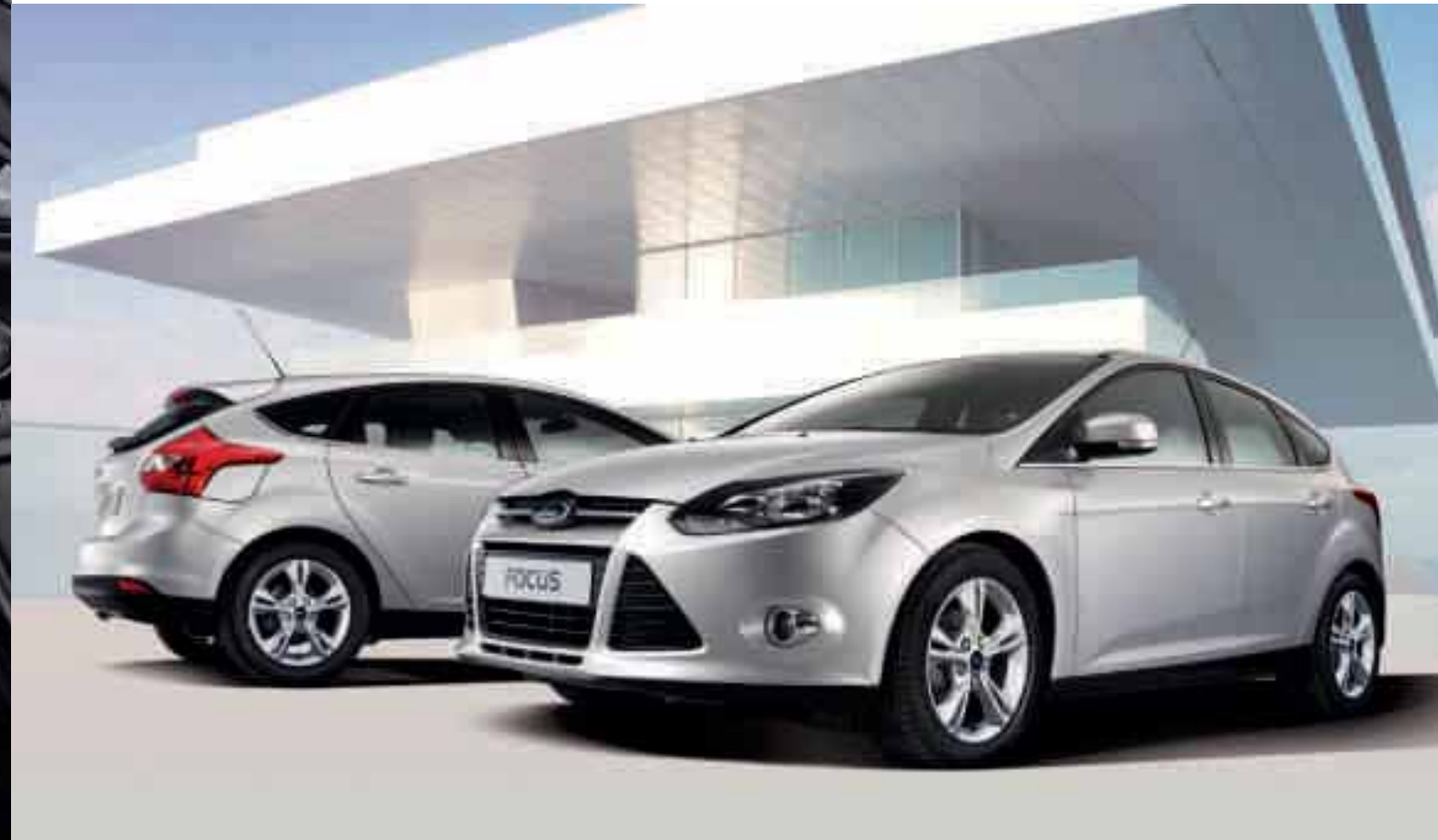
Image on left depicts standard Focus 'Zetec' interior. Image below depicts a Focus 'Zetec' 5-door in Moondust Silver metallic paint (option).

New Ford Focus's dynamic character really comes alive in the Zetec, with an even greater emphasis placed on driving enjoyment.