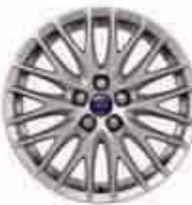
17" 10x2-spoke alloy wheel (Part of optional Focus Zetec Pack and accessory)