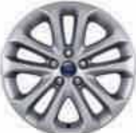
17" 5x2-spoke alloy wheel (Accessory)