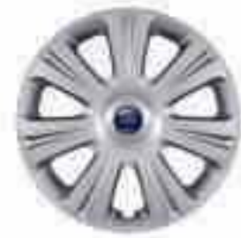
16" 7-spoke wheel cover (Standard on on 'Focus')

A range of distinctive alloy wheels purpose-designed to complement new Ford Focus's dynamic lines.