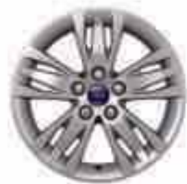
16" 5x3-spoke alloy wheel (Part of optional Focus Edge Pack and accessory)