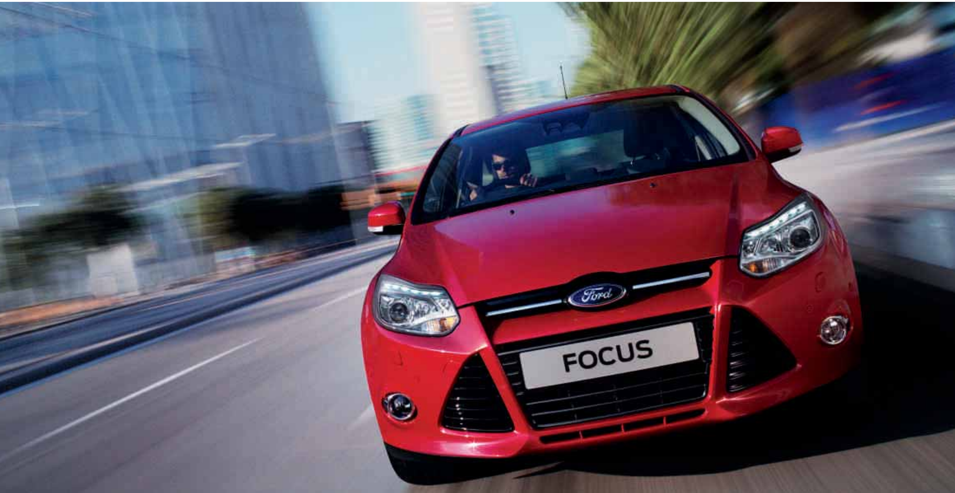
Model shown is a Ford Focus Titanium 5-door in Candy Red metallic paint (option) with Vision Pack (option).

New Ford Focus's technology raises the bar in its class. Advances like Active City Stop, Lane Departure Warning and Lane Keeping Aid are designed to bring a new level of sophistication to your driving experience.