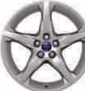
18" 5-spoke alloy wheel (Option and accessory)